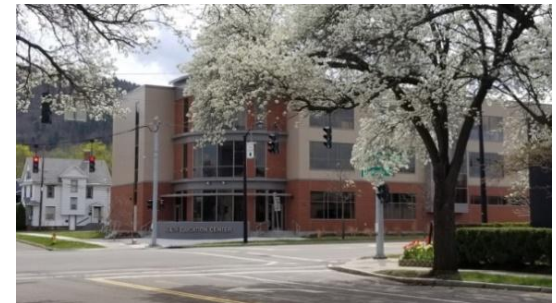
The Health Education Center located in the City of Corning