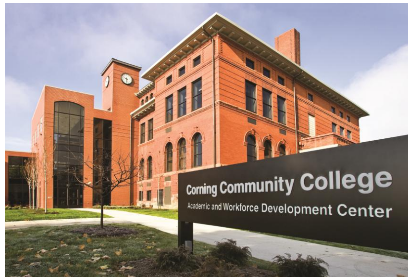
Elmira Academic and Workforce Development Center