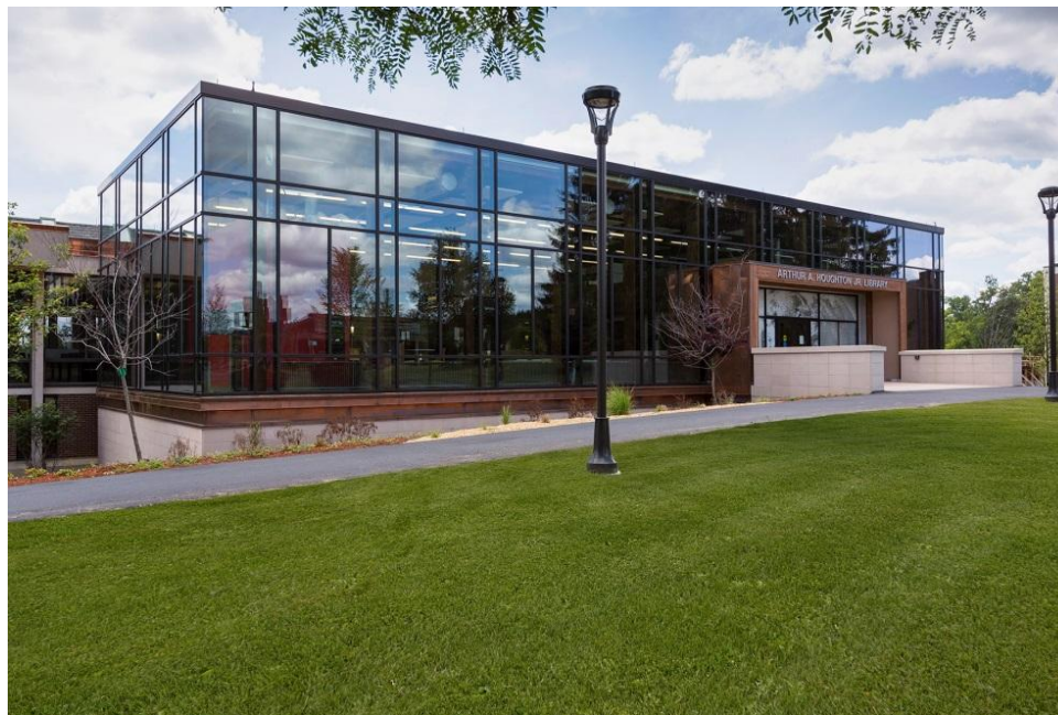
Arthur A. Houghton Library

In a power outage, the Perry Hall fire alarm system has 90 minutes of back-up power. In the event the power in Perry Hall goes out, residents may stay in the building for 60 minutes waiting for the power to restore. If the power does not restore within 60 minutes, residents will be evacuated to the Commons Building.