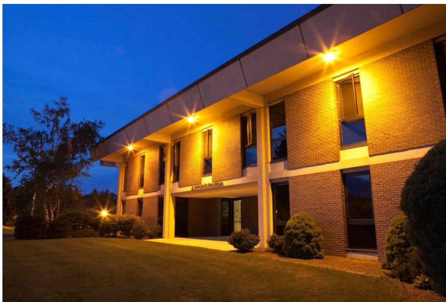
Parsons Administration Building