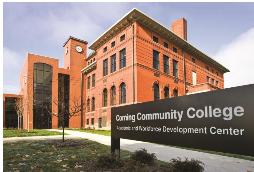
Elmira Academic and Workforce Development Center