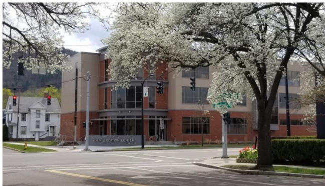
The Health Education Center located in the City of Corning