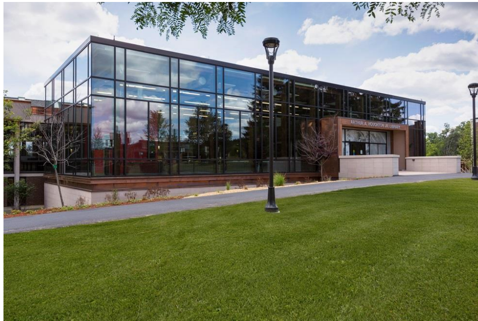
Arthur A. Houghton Library

In a power outage, the Perry Hall fire alarm system has 90 minutes of back-up power. In the event the power in Perry Hall goes out, residents may stay in the building for 60 minutes waiting for the power to restore. If the power does not restore within 60 minutes, residents will be evacuated to the Commons Building.