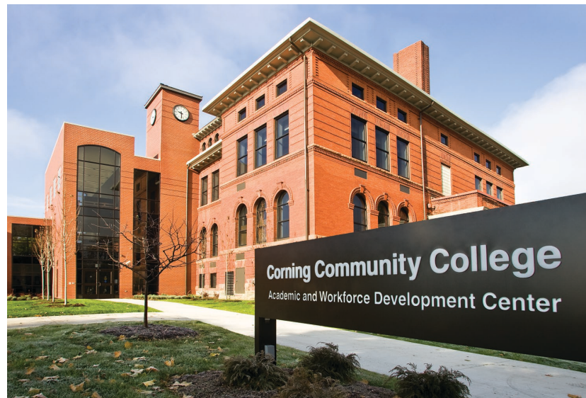
Elmira Academic and Workforce Development Center