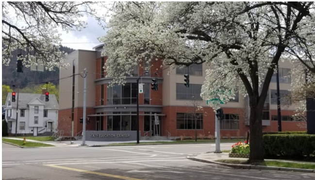
The Health Education Center located in the City of Corning