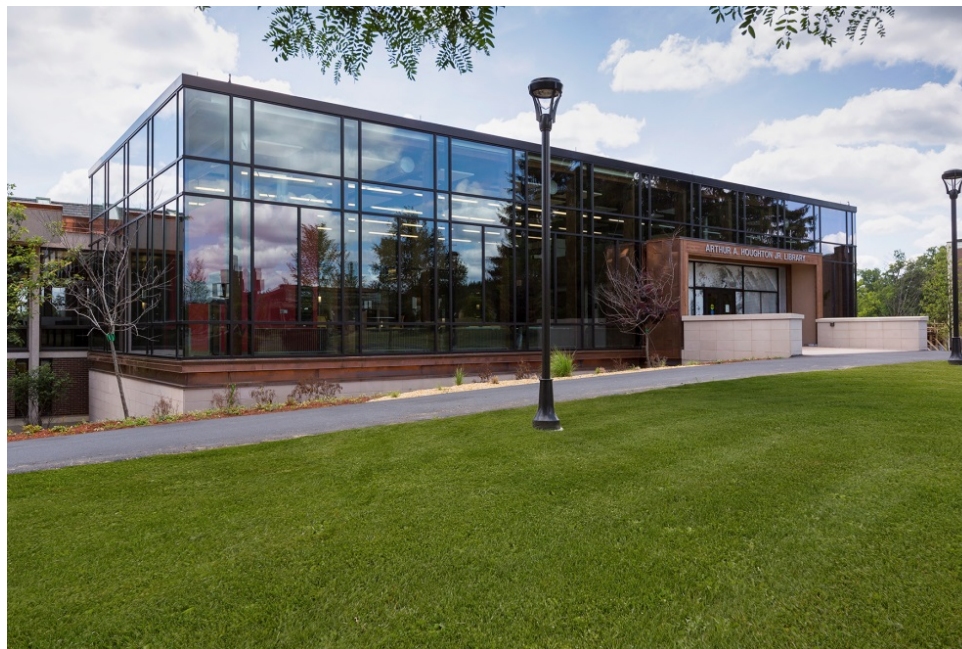
Arthur A. Houghton Library

In a power outage, the Perry Hall fire alarm system has 90 minutes of back-up power. In the event the power in Perry Hall goes out, residents may stay in the building for 60 minutes waiting for the power to restore. If the power does not restore within 60 minutes, residents will be evacuated to the Commons Building.