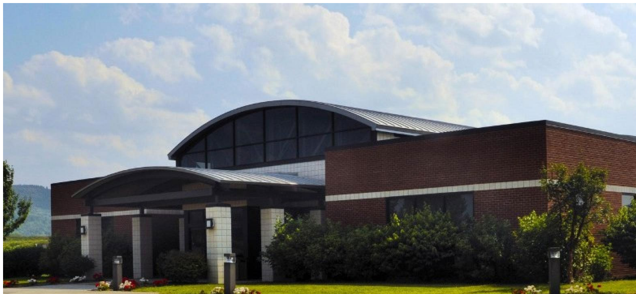
Airport Corporate Park