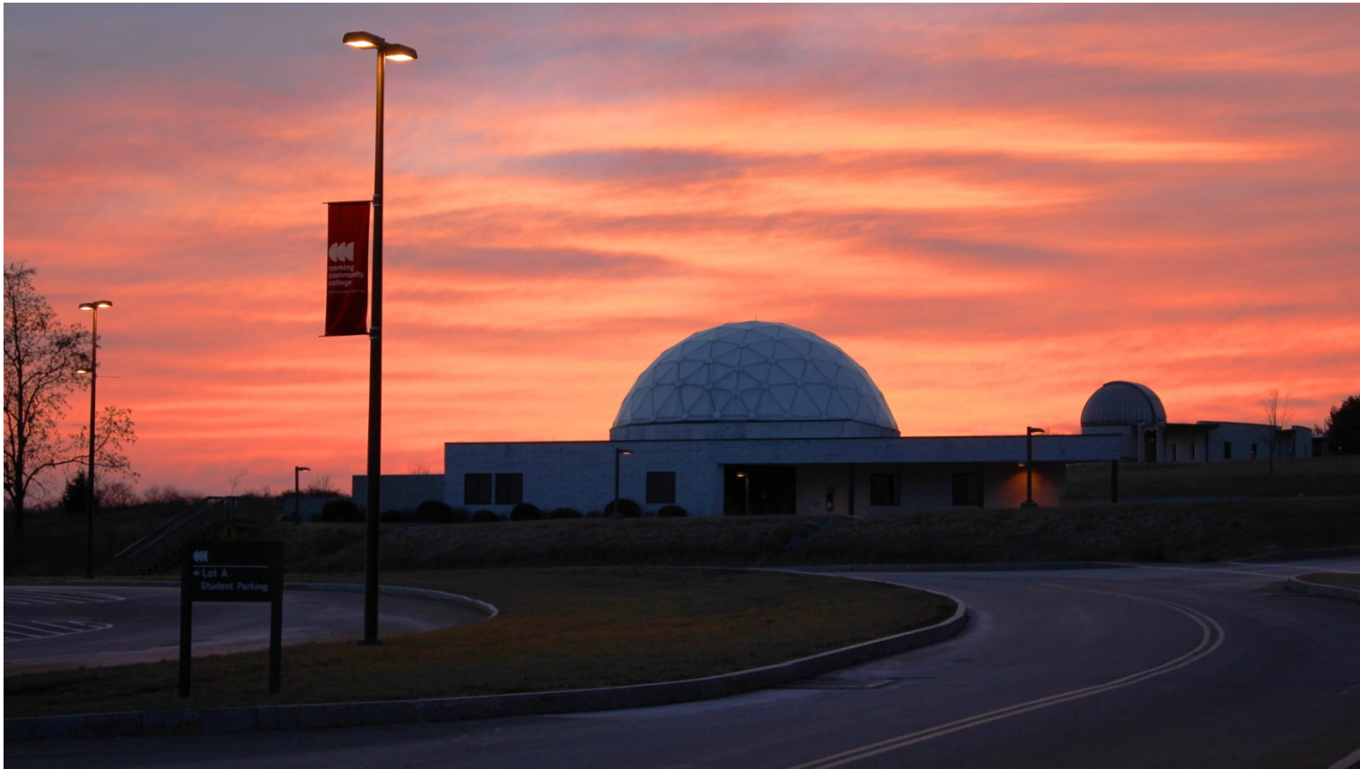
Planetarium and Observatory Buildings