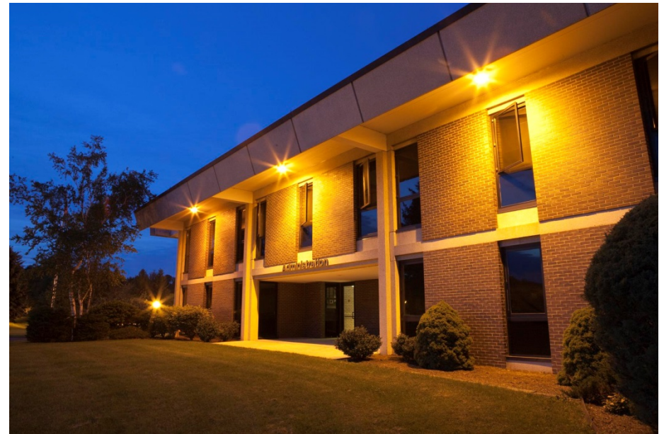
Parsons Administration Building